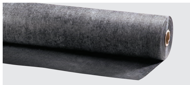
GlasPave Waterproofing Paving Mat