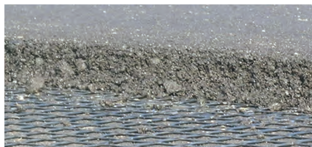
GlasGrid Pavement Reinforcement System