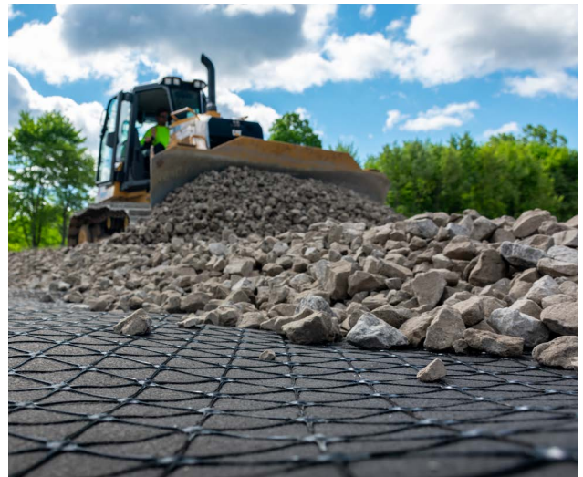
The high profile ribs and nodes of TriAx geogrid allow full aggregate strikethrough when combined with a lightly laminated fabric.

FilterGrid stabilizes working surfaces, such as paved and unpaved roadways, airfields, crane pads and other working surfaces by providing confinement, separation and filtration. FilterGrid combines the stabilization benefits of TriAx with the separation and filtration benefits of a non-woven fabric.