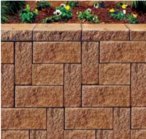
Mesa Ashford Pattern 2-1-2

These units are available in the same colors, blends and textures as other Mesa Units. They can even be antiqued for a beautiful weathered look with minimal product waste. Walls can be built to a near-vertical facing angle, or they can be installed to create 90° corners, stairs and dramatic serpentine curves.