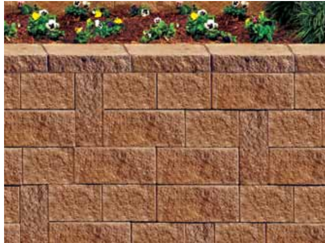
Mesa Ashford Pattern 6-7-2