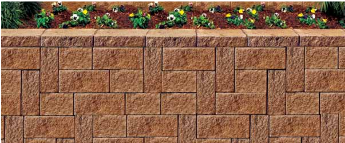
Mesa Ashford Pattern 6-7-5