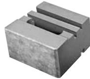
Medium Unit: 8"h x 12"w x 11"d nom. 60 lbs