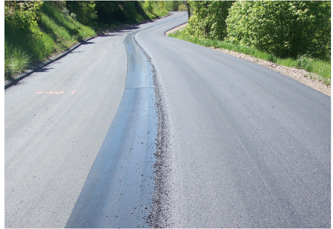
Nebo Loop Scenic Byway