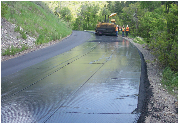
Nebo Loop Scenic Byway

THE CHALLENGE: Utah County needed to bolster the byway, which is closed in the winter, with a quality pavement system that protects against reflective cracking and reduces the maintenance and life-cycle costs of the road. The rugged canyon environment and resulting road layout meant that challenging slope, temperature, dampness and directional factors had to be addressed during the project.