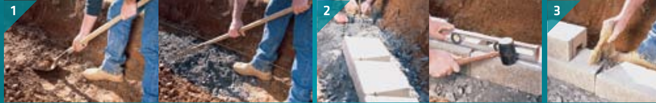
1 Dig a trench for the base.