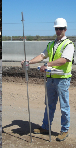
Tensor Engineers perform DCP testing on behalf of the contractor.