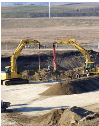
Rammed Aggregate Pier® Installation

Subgrade conditions for wind turbine structures are usually the biggest variable in tower foundation design and construction. Whether your site is challenged by soft clays, loose sandy deposits, or even organic soils, Geopier design engineers have numerous Geopier ground improvement options to choose from to help satisfy your project's performance needs.