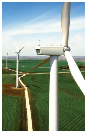
Victory Wind Farm Carroll & Crawford Counties, Iowa