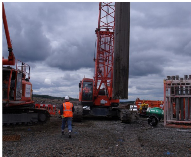
Spreading crane loads more widely enhances stability of the crane pad area.