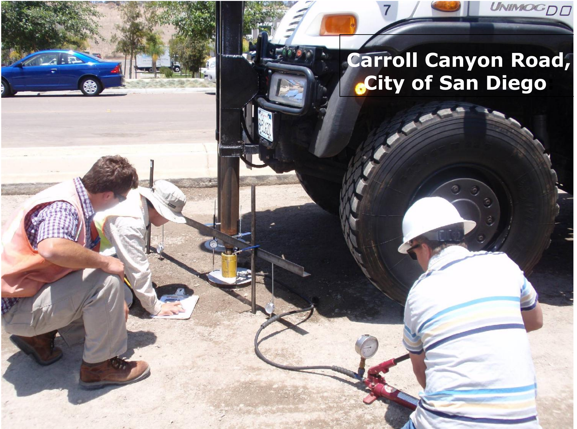
Carroll Canyon Road, City of San Diego