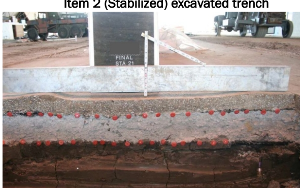
Item 2 (Stabilized) excavated trench