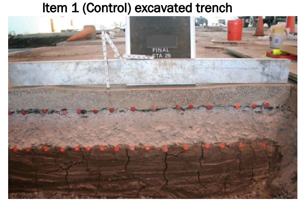
TriAx RD USCOE Full scale traffic study Phase II.docx