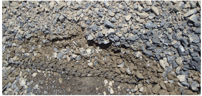
The unique properties of TriAx Geogrid allowed for a reduction in aggregate requirements that led to an estimated $1.2 million in savings.