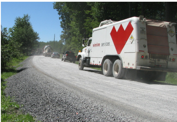
Before TriAx Geogrid, the DCNR access roads were not suitable for traffic or heavy equipment. Now, the access roads easily support approximately 1,000 heavy vehicle trips per day.

THE CHALLENGE: Heavy trucks exploring natural gas formations in the area had made the existing access road, an unpaved forestry arterial maintained by the Pennsylvania Department of Conservation and Natural Resources (DCNR), unsuitable for traffic. The project owner needed an affordable way to restore the unpaved road and support year-round traffic volumes of up to 1,000 heavy vehicle trips per day.