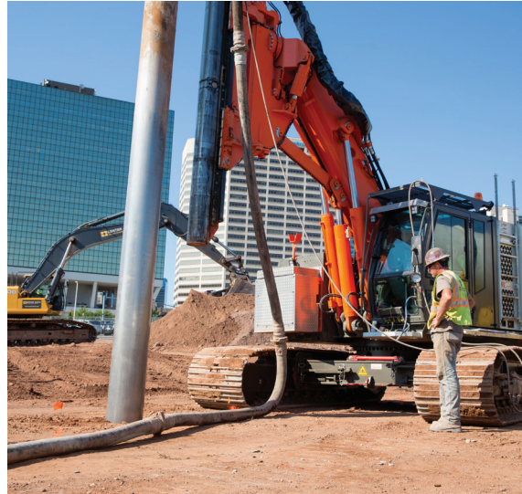
Geopier GeoConcrete® Column (GCC) Rigid Inclusion System

Geopier's geotechnical engineers can combine rigid inclusions with any of our proprietary systems to deliver the most cost-efficient design-build ground improvement solution for your project.