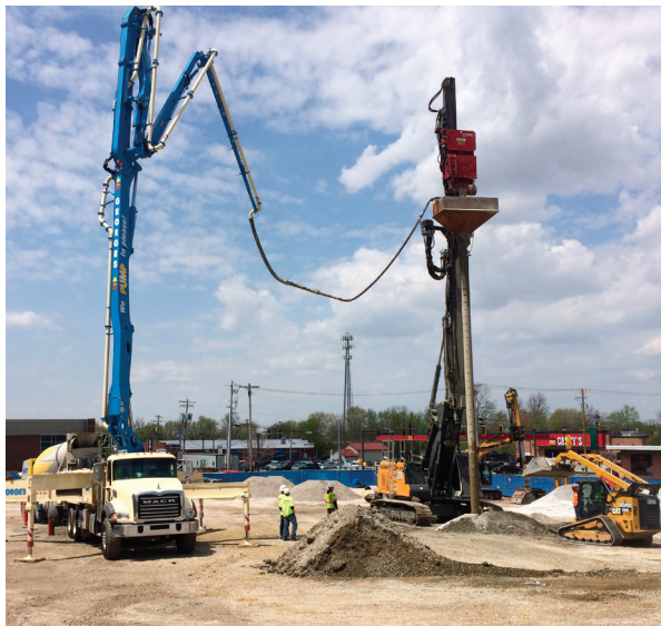
Geopier Grouted Impact® Rigid Inclusion System

Rigid inclusions are ground improvement elements used to transfer loads through weak, compressible soils to deeper underlying competent soils. Geopier® rigid inclusions are comprised of plain concrete, aggregate/grout mixture, or cement-treated aggregate. Geopier offers several rigid inclusion technologies, including cement-treated aggregate GP3® Piers, Grouted Impact® Piers, and GeoConcrete® Columns (GCC).