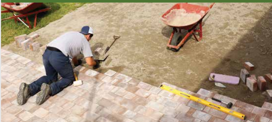
With AmeriGrid Geogrid

Please refer to paver manufacturer for installation guidelines and construction recommendations. Geogrid use is at installer/owner's own risk.