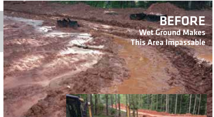
BEFORE Wet Ground Makes This Area Impassable

Use AmeriGrid Jobsite geogrid under roadways, driveways, entrance ways, work yards, and livestock yards to keep them firm and passable year round regardless of how wet the ground is.